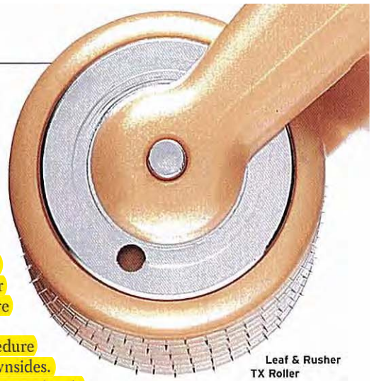
Leaf & Rusher TX Roller

Although human studies on skin needling have thus far been performed only on the face, Leaf has had patients use the device on their cleavage and "found immense improvement in fine lines in that area." One enterprising woman applied an anticellulite cream once a day to both thighs, but rolled it in on only one leg. "Within a month, the needled thigh was one inch smaller than the control," he says. "We haven't done a study, but it sounds interesting." —MEGAN DEEM