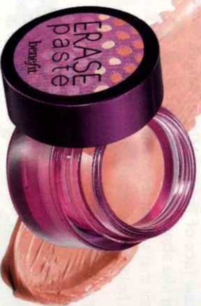
BENEFIT ERASE PASTE "It's a concealer with good coverage that doesn't look too thick when you apply it." $26; benefitcosmetics.com.