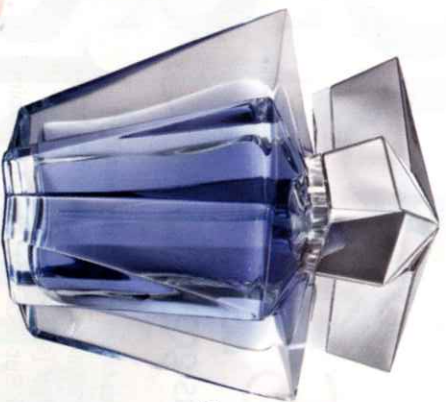
THIERRY MUGLER ANGEL EAU DE PARFUM "The longer this scent stays on, the better it gets." $177/2.6 oz.; saks.com.