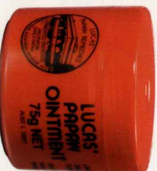
LUCAS' PAPA W OINTMENT "I use this on dry patches and on my lips." $18; supplement spot.com.