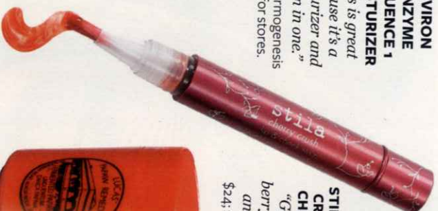
STILLA CHERRY CRUSH LIP & CHEEK STAIN "Gives a nice berry tint to lips and cheeks." $24; sephora.com.