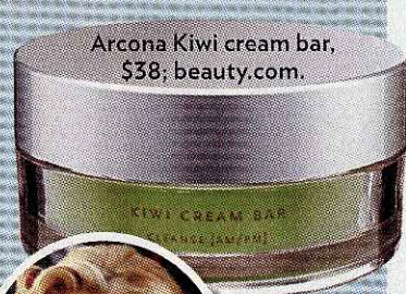
Arcona Kiwi cream bar, $38; beauty.com.

Environ C-Quence eye gel, $84; 323-931-4442.