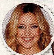
Jovovich-Hawk fan KATE HUDSON

Satisfy your label lust without breaking the bank with these new cheap chic offerings from luxe designers